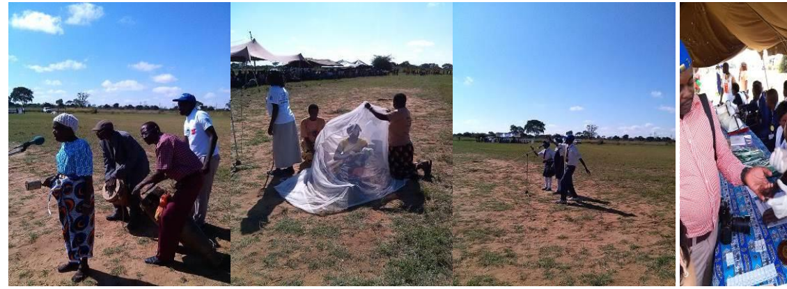
Songs, plays, poems and testing for parasites

The WMD was a successful event attended by people from all walks of life. Poems songs and plays laden with malaria messages provided entertainment to the participants.