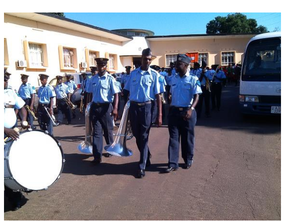
Zambia Air Force brass band