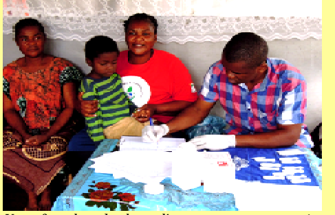
Un enfant dans les bras d'un agent communautaire pour la lute contre le paludisme, prêt à subir le test rapide du paludisme.

Thanks to the control interventions implemented in the past years, malaria transmission in Bioko Island (Equatorial Guinea) has become heterogeneous. To tackle this situation, intensified activities are being implemented in areas of higher endemicity. The intensified inter-